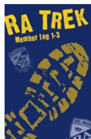
One for each boy based on grade level